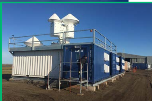
AMF3: Oliktok Point, Alaska (2013–2021)