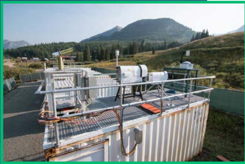
AMF2: Gothic, Colorado (2021–2023)