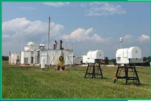
AMF1: La Porte, Texas (2021–2022)

Measurements obtained by these instruments are collected by computers inside an operations shelter. This shelter houses numerous computer stations for data and communication systems. The AMF operates 24 hours a day, seven days a week and is maintained by ARM staff. Because it is designed to support the scientific community, the AMF can also host guest instruments from collaborating researchers funded by DOE or other agencies. For a full list of available instruments, see www.arm.gov/capabilities/observatories/amf .