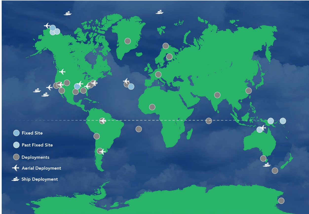
Figure 1. Locations of ARM fixed observatories, and the mobile, aerial, and ship-based deployments as of 2024.

Each ARM observatory includes an extensive set of instruments that measure the surface energy balance and the atmospheric properties that impact that balance, with a particular emphasis on cloud and aerosol measurements. Below is a list of core instruments provided at each of the ARM fixed-location observatories and with most mobile facility deployments.